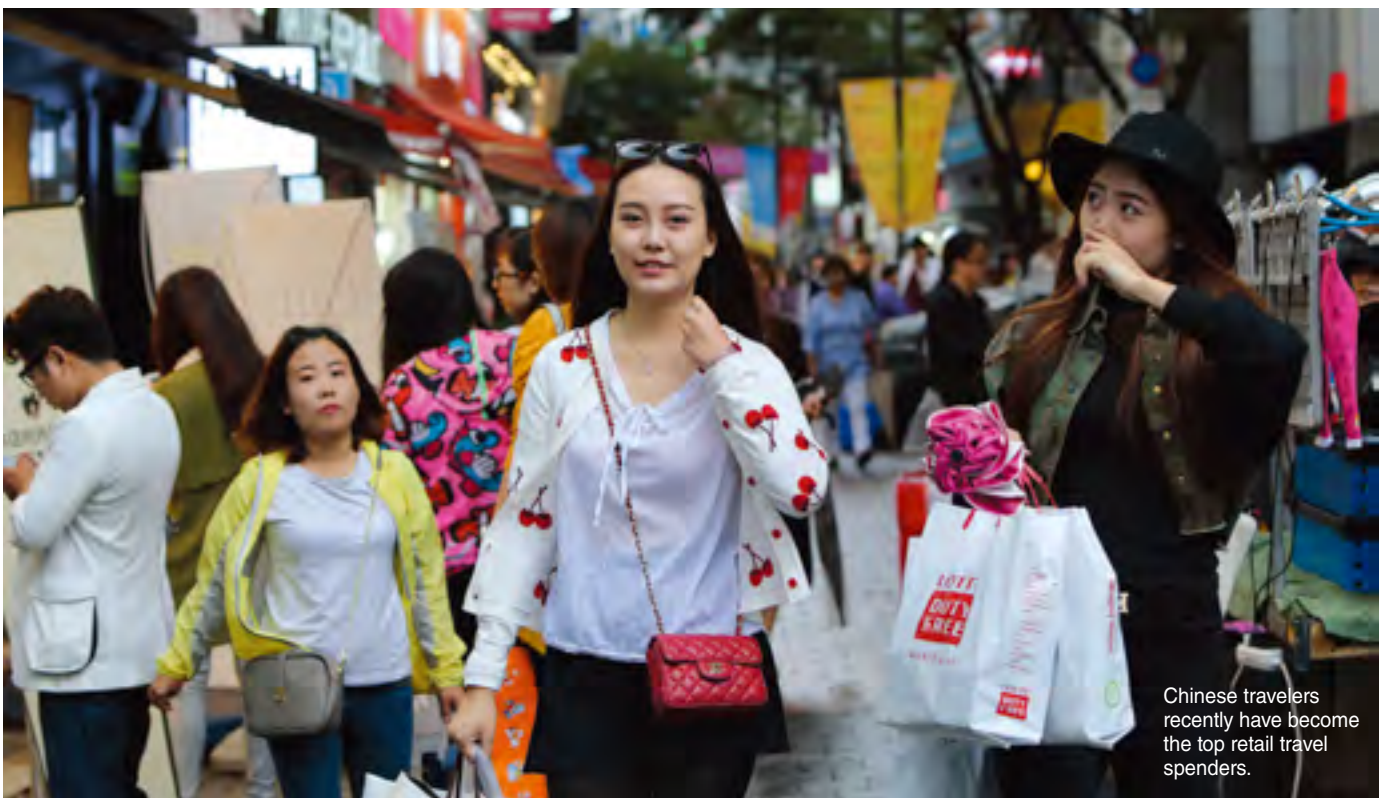
Chinese travelers recently have become the top retail travel spenders.