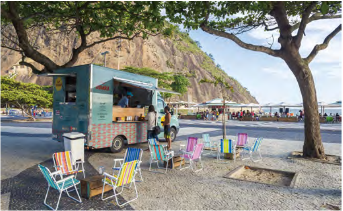
Mobile food truck parked near Itacoatiara Beach, the surf spot in the Niteroi neighborhood, waits for customers.

two have quit their former jobs in multinational companies and now take turns in supervising the business. They have also hired a management consulting firm to help them with their expansion plan.