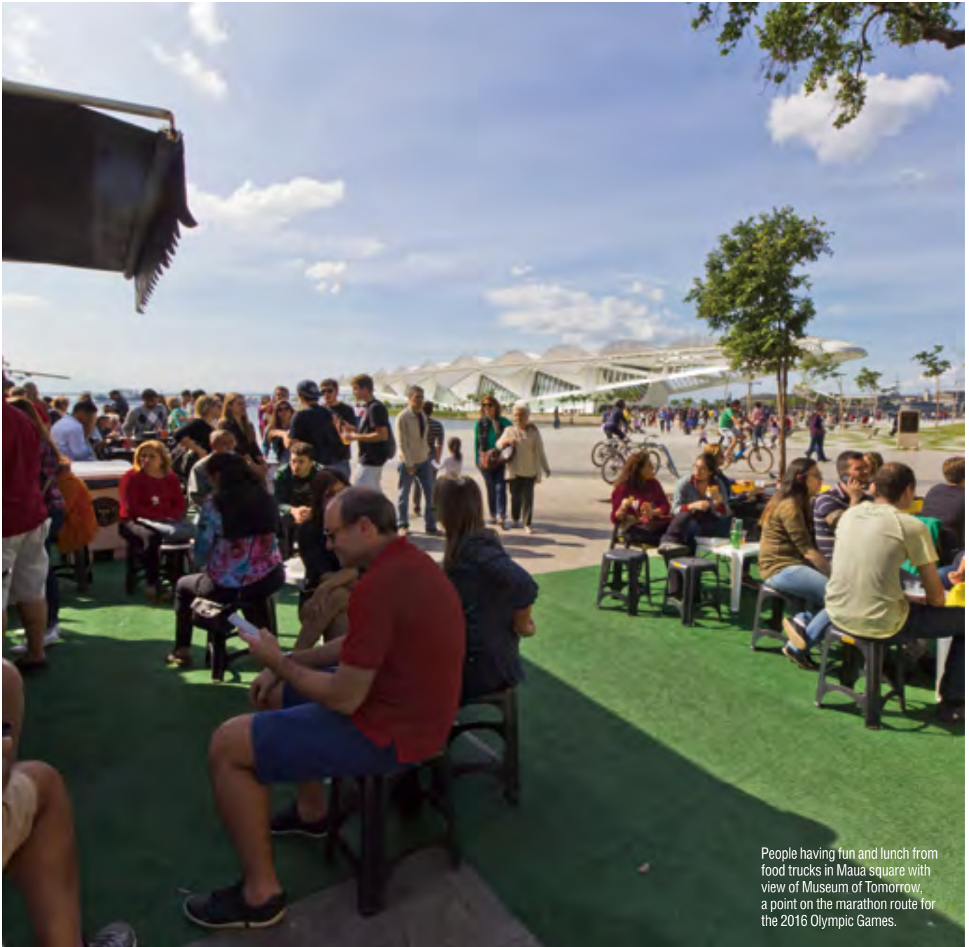
People having fun and lunch from food trucks in Maua square with view of Museum of Tomorrow, a point on the marathon route for the 2016 Olympic Games.