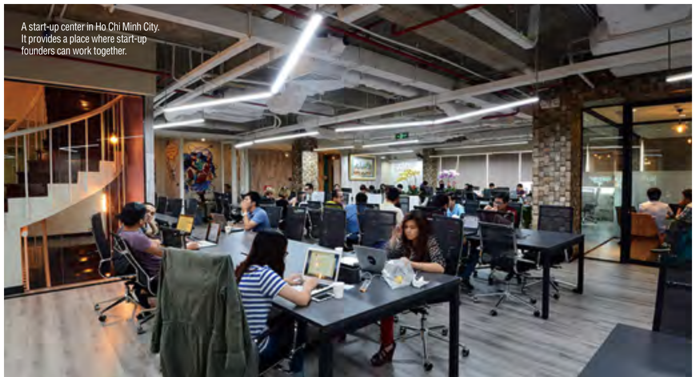
A start-up center in Ho Chi Minh City. It provides a place where start-up founders can work together.

In Vietnam, the number of smartphone users is around 22 million and predicted to reach 26 million in 2016.