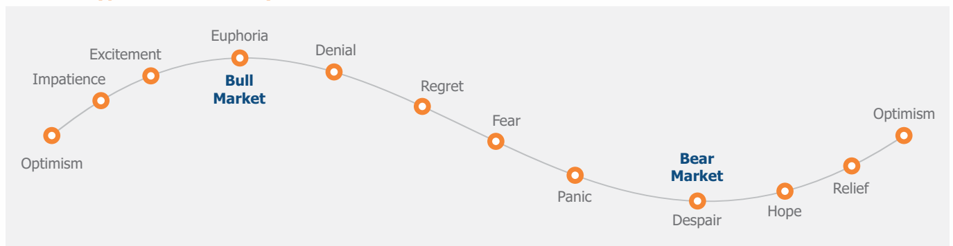
Chart 1: Typical emotional cycle in stock market

Different emotions follow the investment cycle as mapped in chart 1. In any given situation, investors think and act in a certain way based on their personality traits, emotional state and psychological make-up. These factors complicate the investment decision-making process and defy logical reasoning.